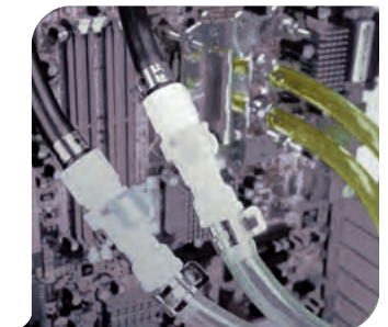
Figure 2: Quick disconnects for server cooling

Some liquid cooling systems employ couplings developed for the hydraulics industry because of their perceived higher durability. However, the seals and internal valves of these couplings were not designed for low-pressure applications and where couplings are required to be connected for months or years at a time. When selecting quick disconnect couplings for liquid cooling systems, look for couplings that are designed specifically for low-pressure applications and feature robust construction.