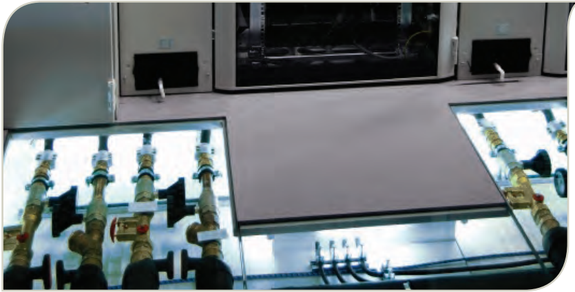
Reliable quick disconnect couplings play a significant role in liquid cooling systems that mitigate heat generation at the source.